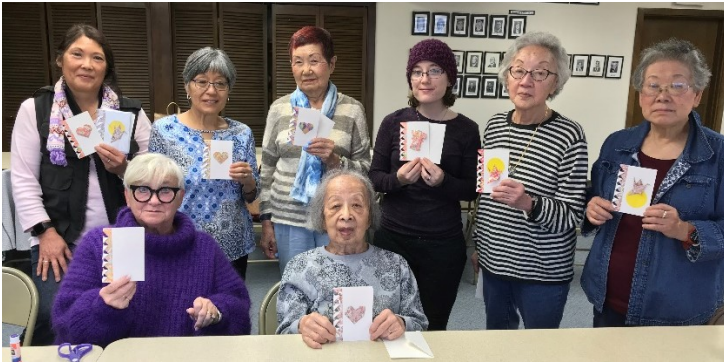
BWA craft session