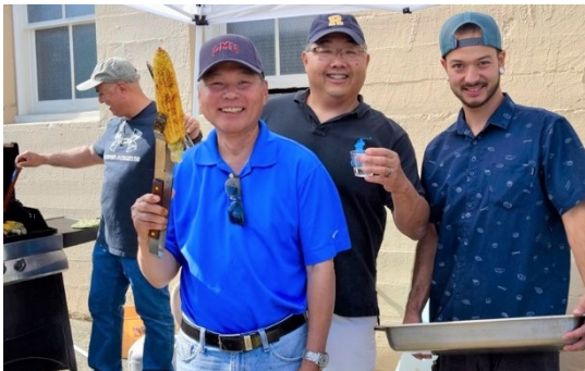
Corn crew at Obon