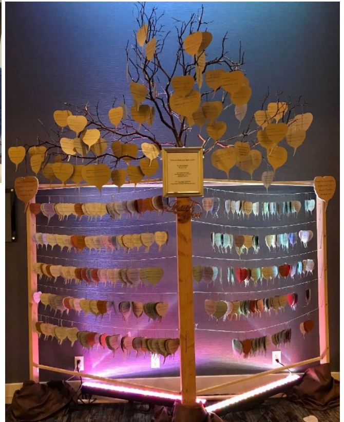
Arigato Obaachan donation tree at the BWA World Convention in San Francisco.